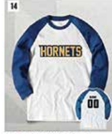
14. ADULT RAGLAN (White/Navy) $24.00