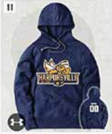
11. U.A WOMENS STADIUM HOODIE (Navy) $39.00