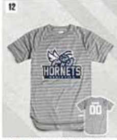
12. STRIPED PREMIUM PERF TEE (Grey) $23.00