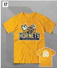
17. SHORT SLEEVE TEE (Gold) $15.00