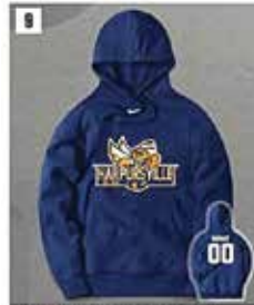
9. NIKE TEAM CLUB HOODIE (Navy) $40.00