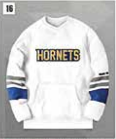
16. THROWBACK VARSITY PULLOVER (White/Navy) $32.00