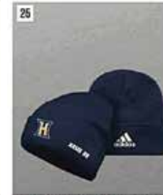
25. ADIDAS CLIPPED KNIT BEANIE (Navy) $21.00