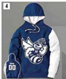
4. STITCH SLEEVE HOODIE (Navy) $34.00