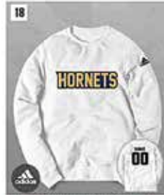
18. ADIDAS BASIC CREWNECK (White) $34.00