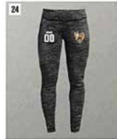
24. ADIDAS YOGA PANTS (Heathered Charcoal) $30.00