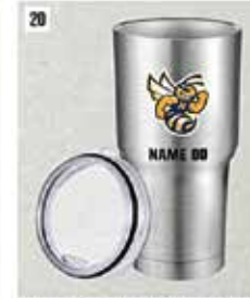
20. STAINLESS STEEL TUMBLER (30 OZ) (Stainless Steel) $21.00