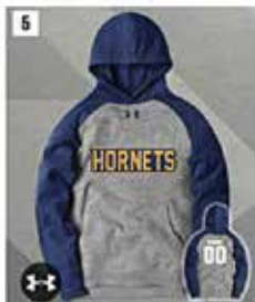
5. U.A MENS STADIUM HOODIE (Navy) $35.00