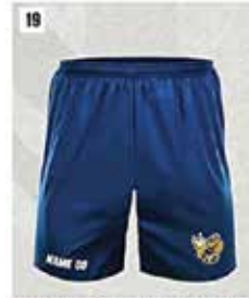
19. ADULT PERFORMANCE SHORTS (Navy) $22.00