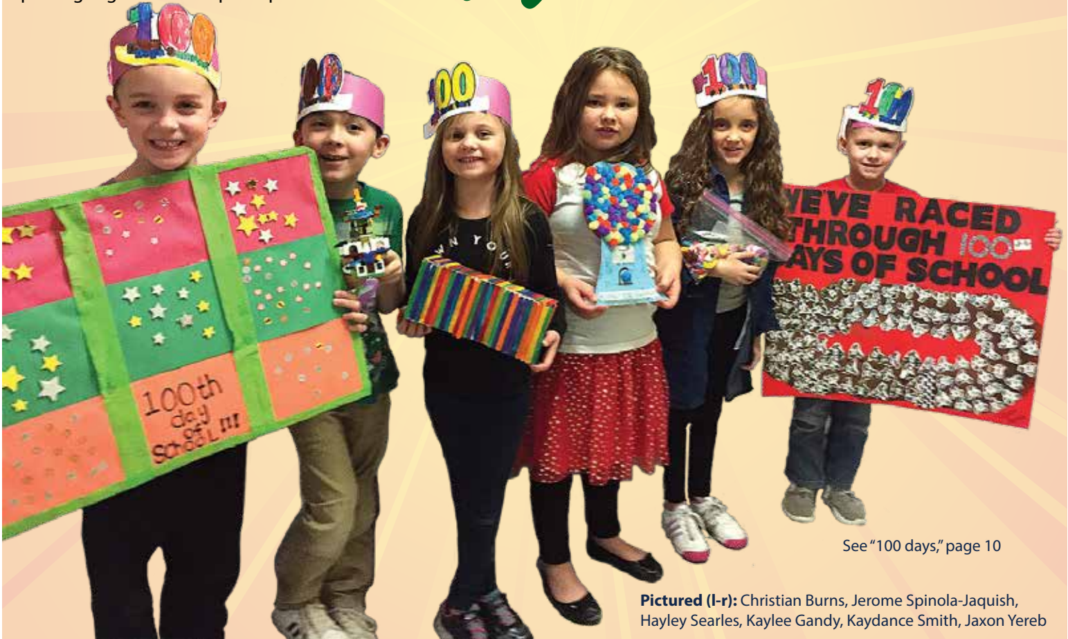
See "100 days," page 10