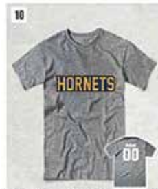
10. ELONGATED VINTAGE TEE (Sport Grey) $19.00