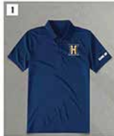
1. ADULT MENS PERFORMANCE POLO (Navy) $34.00

Working with our brand advisors, the company has set up a website where these items can be purchased online. Here is the address http://shop.fancloth.com/13787/364743