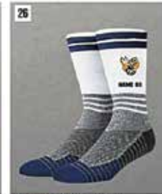
26. TECH SOCKS (White /Navy) $16.00