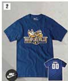
2. NIKE CORE TEE (Navy) $22.00