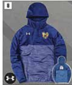
8. U.A LIGHTWEIGHT TECH HOODIE (Navy) $47.00