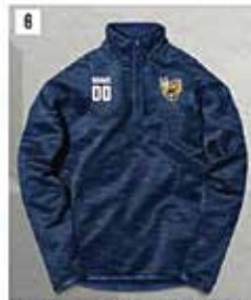
6. 1/4 ZIP PERFORMANCE PULLOVER (Navy) $30.00