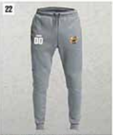
22. RIPPED FLEECE JOGGERS (Grey) $29.00