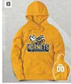
13. HOODIE (Gold) $27.00