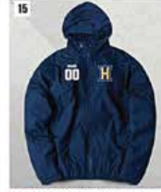
15. LIGHTWEIGHT WINDBREAKER (Navy) $26.00