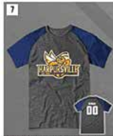
7. SHORT SLEEVE RAGLAN TEE (Navy) $17.00