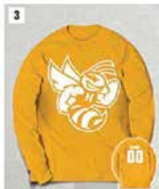
3. LONG SLEEVE TEE (Gold) $25.00