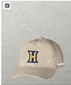
23. ADULT DAD CAP (Tan) $20.00